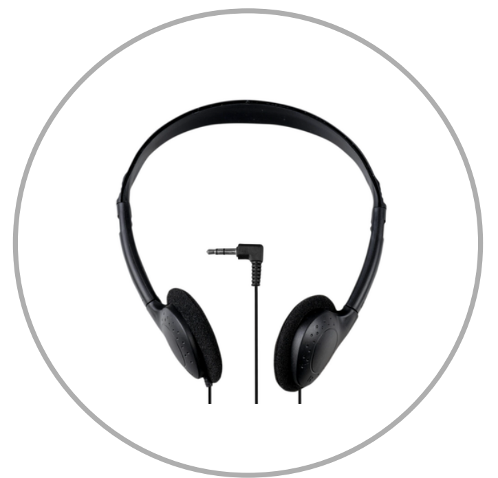
1 pair headphones