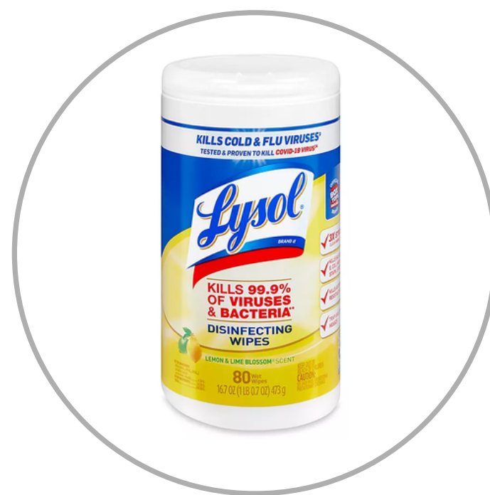
2 packs of Lysol/ Disinfectant Wipes