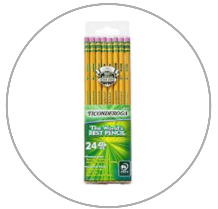
2 packs of pencils