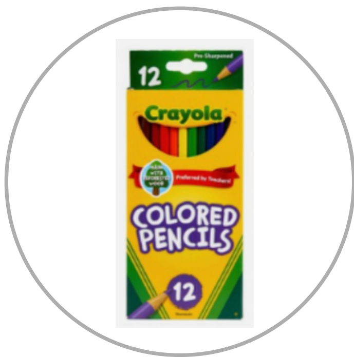
1 pack of colored pencils