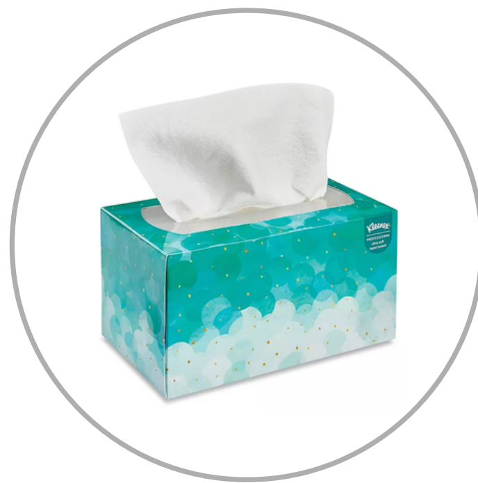
2 boxes of tissues