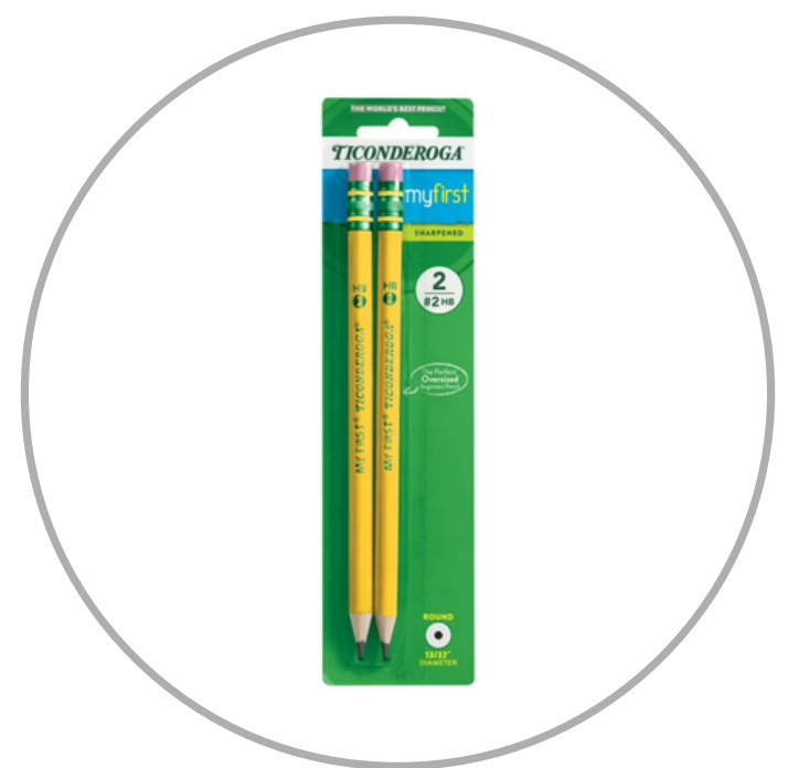
2 Jumbo Pencils (PK Only)