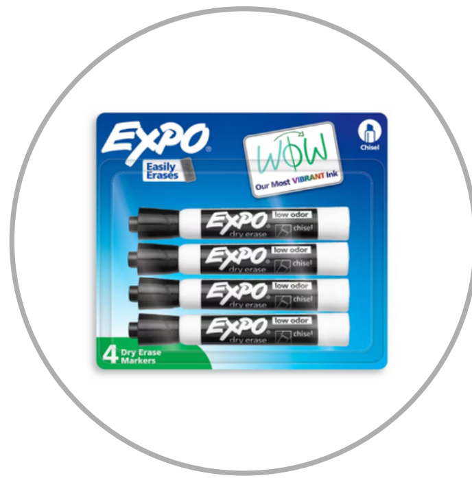
2 packs of dry erase markers