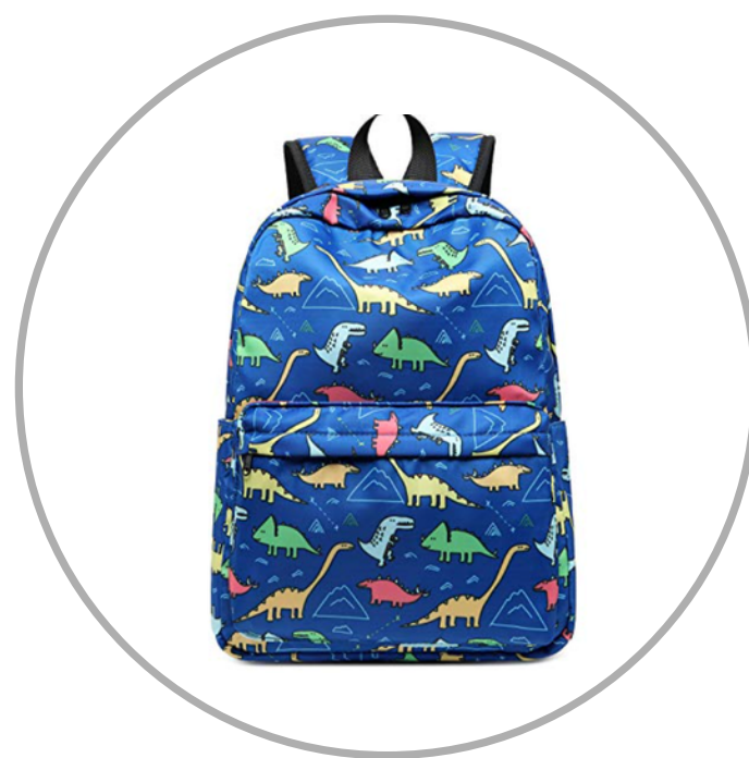
Any type of backpack