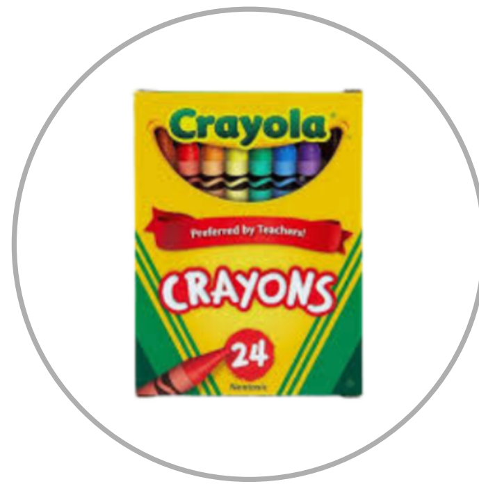
2 packs of crayons