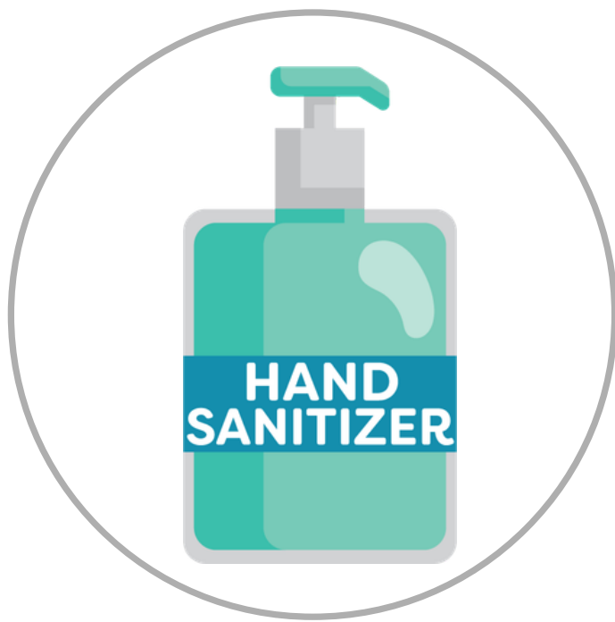
2 hand sanitizers

Please purchase the following items and bring to school. We will collect supplies and distribute for use throughout the school year.