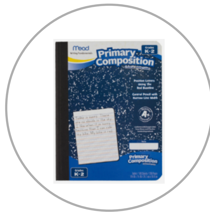
1 Primary Composition Notebook